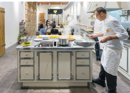
MaMa Florence Cooking School