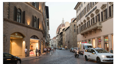
Hotel McGallery Cerretani - Florence