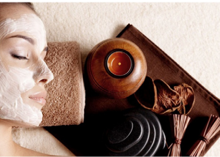
San Giovanni Terme Rapolano Spa Resort