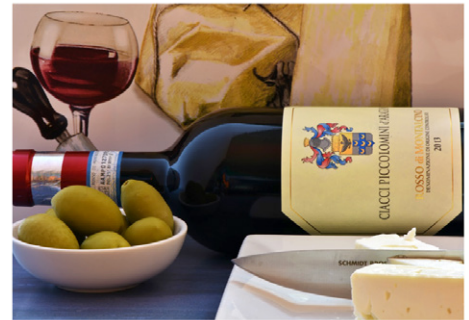
Ciacci Piccolomini d’Aragona Winery